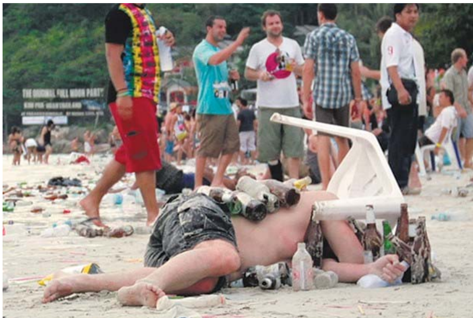
A partier sleeps on Haad Rin beach in Gringo Trails.

When Yossi Ghinsberg chronicled his harrowing, near-fatal 1981 trip to the Amazon in the book Jungle , little did he know he'd inspire generations of global backpackers to try to recreate his experiences, transforming the area into a faux adventure tourist trap.